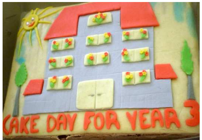
Cake Day....Mmmmmm yum