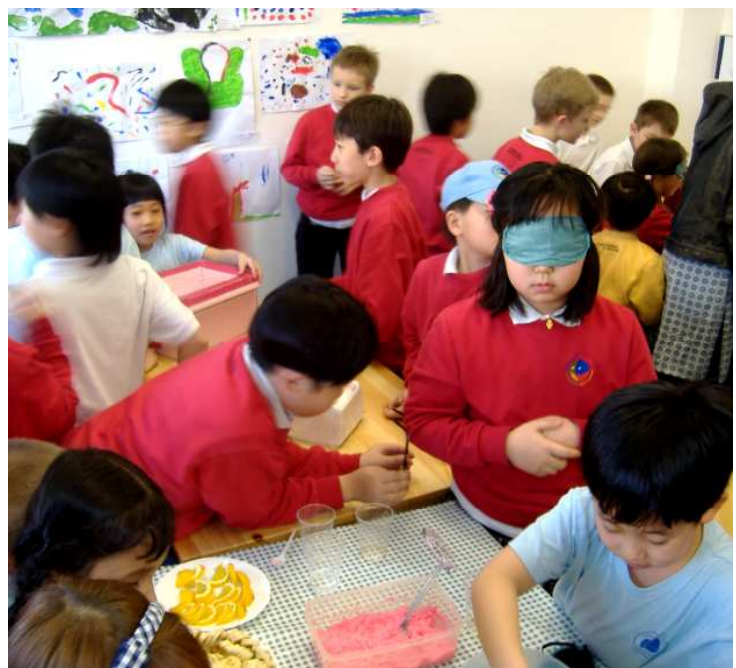
Art for all the senses!