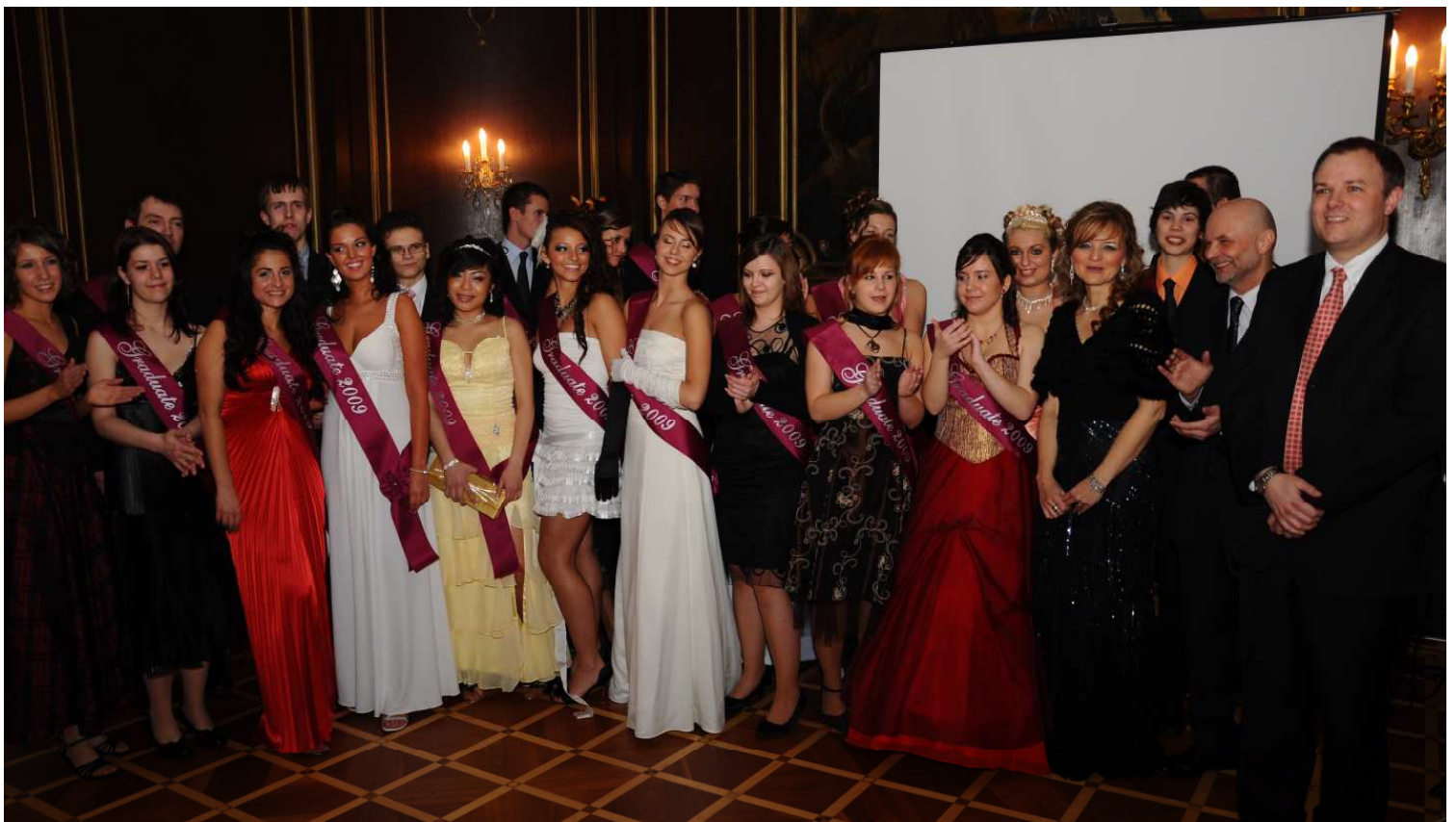
Graduation Ball 2009