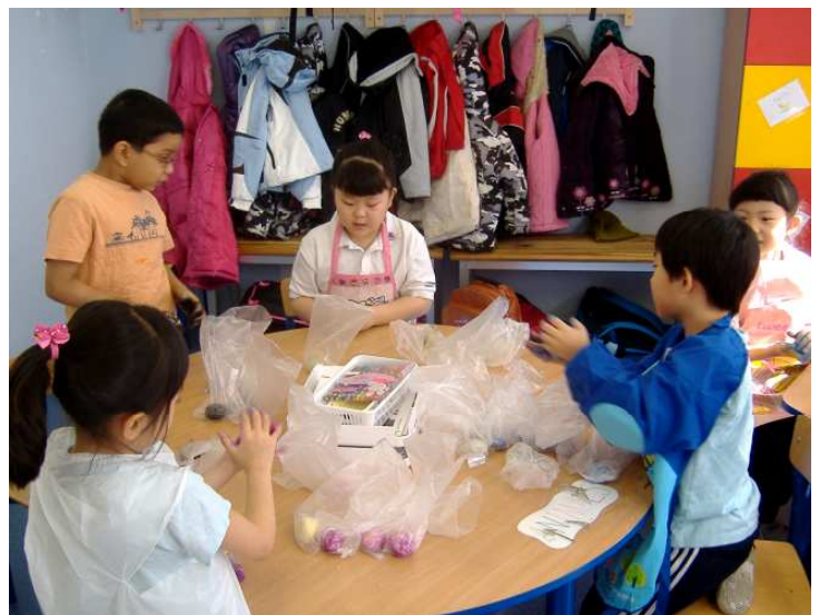
Making play dough

On Tuesday, March 24 th , we invited the entire school and all our parents to ART FOR ALL THE SENSES . It was an exhibition of all that we have been doing in class. Our artwork was on display in the lunchrooms, and we had a station set up for each of the five senses. At these stations, all of our guests were able to do activities set up and carried out by the Year 2 class. There were taste tests, a feely box, blind drawing, hearing tests and scent tests. After going through our exhibition, everyone was given a parting gift of homemade play dough that we made ourselves! We hope that we were able to teach everyone some of what we learned during our IPC unit. Thank you to everyone that came. We had a great time, and hope you did too!