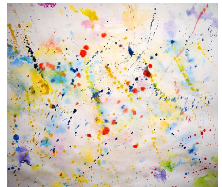
The abstraction. Filip Křížák - Grade 7