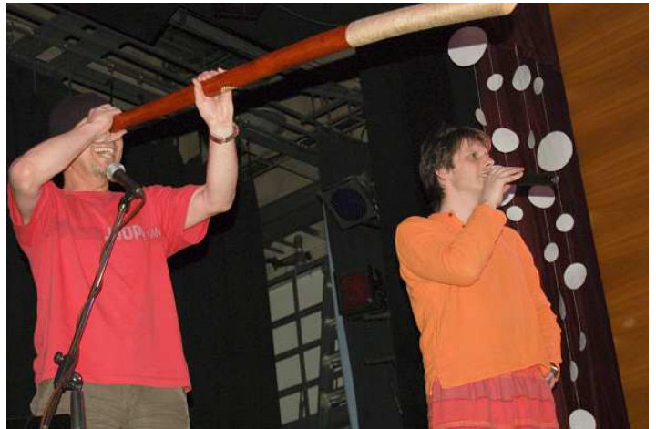
Above: “The Travelers” music group

On 24 th of March in Dům dětí, Grades 6, 7, 8 and 10 were invited to go on a trip “Around the globe” with a group of musicians called “The travelers”. During the performance, we were treated to an arrangement of Australian aboriginal songs, a brazilian samba, reggae from Jamaica, an Indian song, Swedish metal and a crying Hebrew song. The travelers wittily commented about the ethnic instruments they played and invited some of our students to join in during the last song.