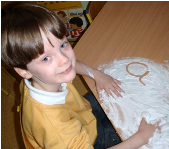
Writing in shaving cream is great fun!