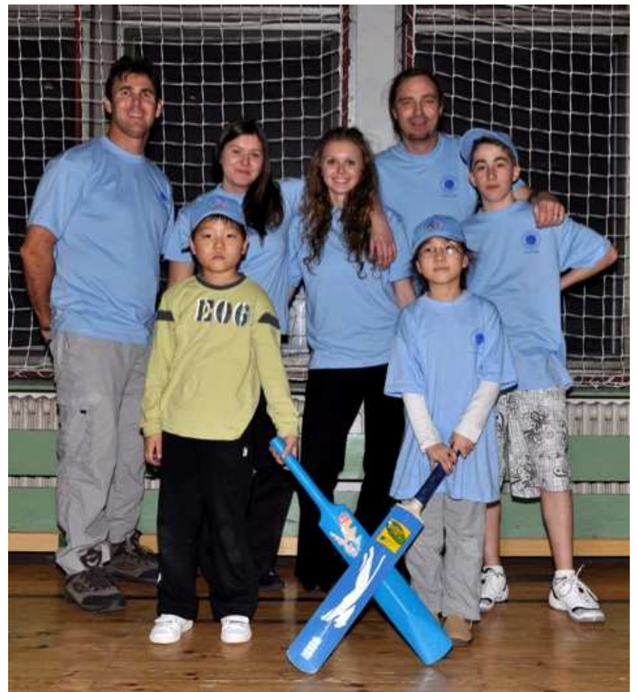
The Czechs placed third