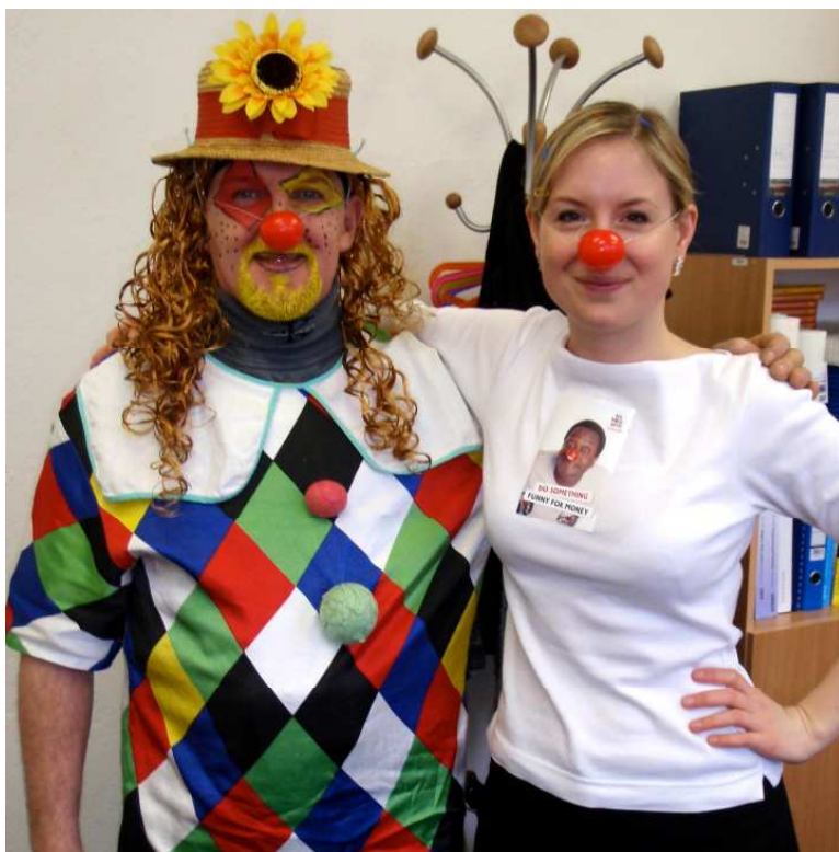
These two are always clowning around!