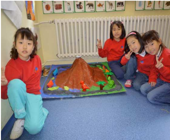
After two weeks of hard work—An erupting masterpiece!