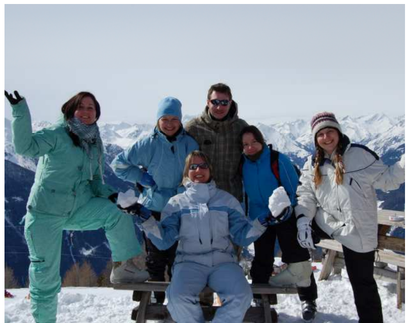
SKI TRIP NUMBER 2, 2009

Just a few days ago, Grade 7, 8, 11, 12 and 13 students came home from an amazing trip to Austria. We started on Tuesday the 10th of March at 7.30 a.m. We left the school in a big bus and were traveling for 10 hours. Surprisingly, the tour in the bus actually was not boring - we were talking, eating, listening to music, watching television and, of course, sleeping. We arrived in Austria and it was so good, everything was white and the view of the mountains was fantastic. The next day we went to the slopes and skied from 9.30 to 15.30. After that, we went shopping. In the evening we had a programme including games prepared by different groups. It was really funny. For example, one of the games was that in teams, we should discuss a scene from a film and then play it in front of the others and the other teams had to recognize from which film the scene was. When we came to the last day, we packed our things, went on another ski and snowboard adventure and after skiing, we went to Mc Donald's and ate our dinner there. After dinner we went to the hotel again, packed our things onto the bus, and slowly we were on the way home. The way home to the Czech Republic took more time than the way to Austria; everybody was tired and sleepy. We arrived back in Ostrava on Sunday the 15th of March at 4:46 in the morning and our parents picked us up. This trip will never be forgotten.