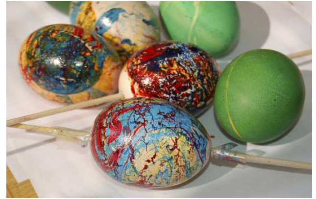
Above and left: The extremely creative grade 6 and 7 classes and their beautiful Easter creations