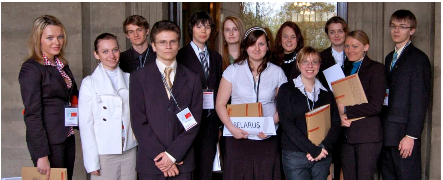
Our RCIMUN delegates