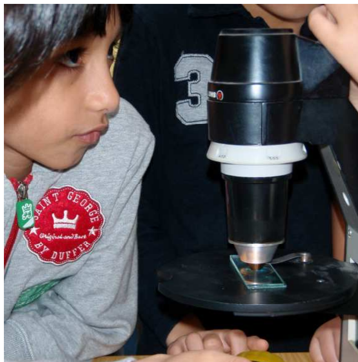
Science week involved lots of hands on activities