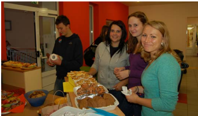
There were a great variety of cakes!