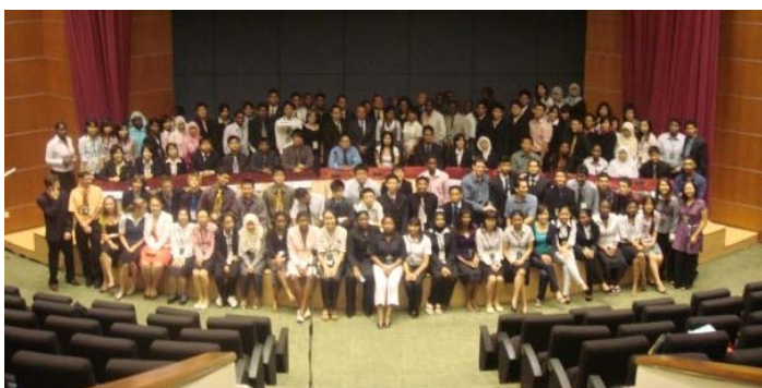
A shot from KLIMUN 2008