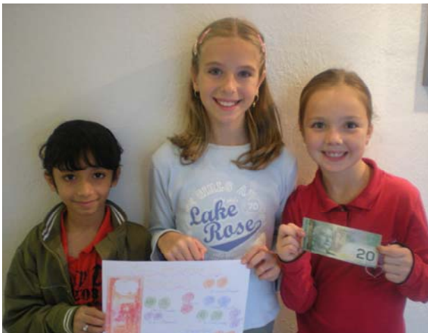
Learning about World currencies