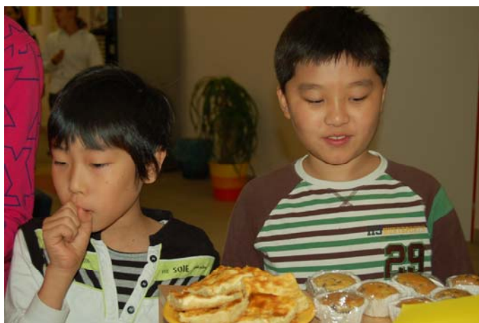
And they were really tasty!