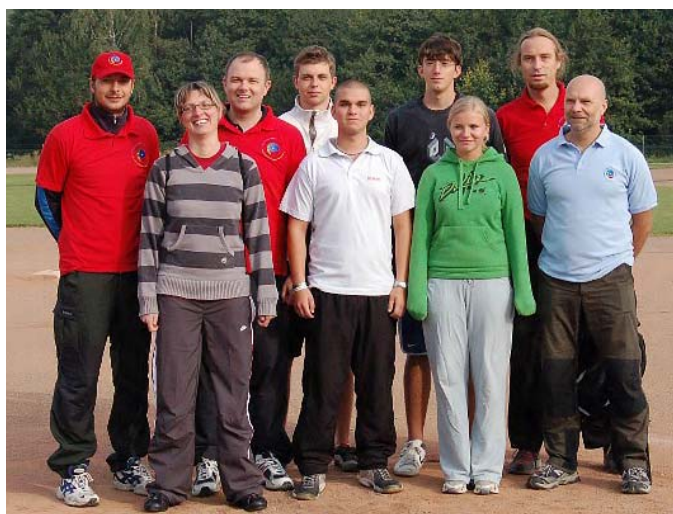
What a team!