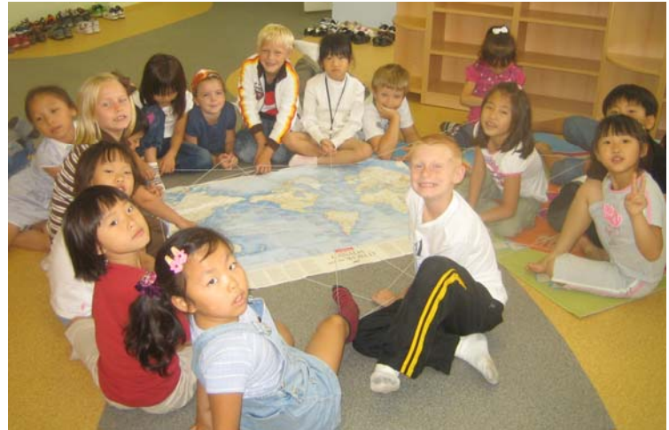
Those Grade 3 kids are a funny bunch