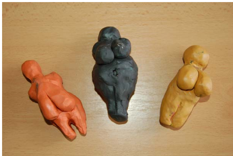
Some interesting creations from Art Class