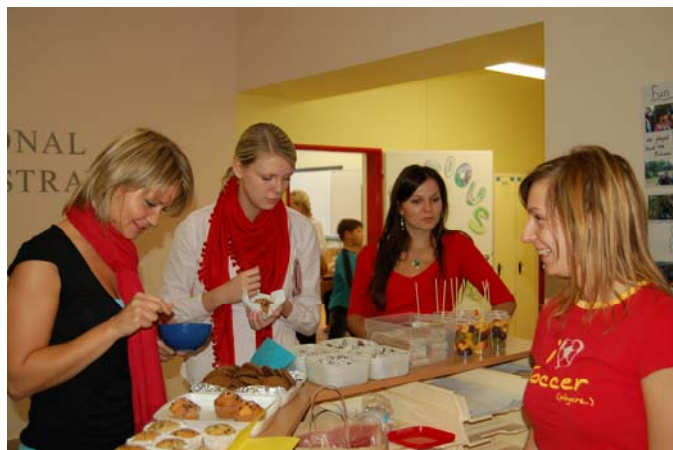
They made great snacks for our hardworking teachers!