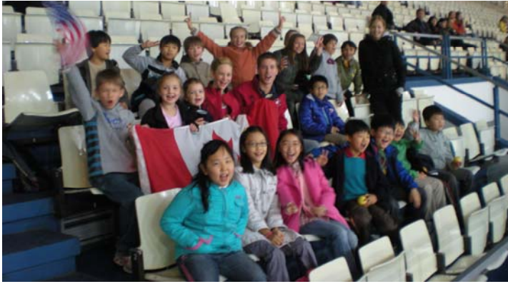
Hangin' out with the Canadian skaters at ČEZ Arena