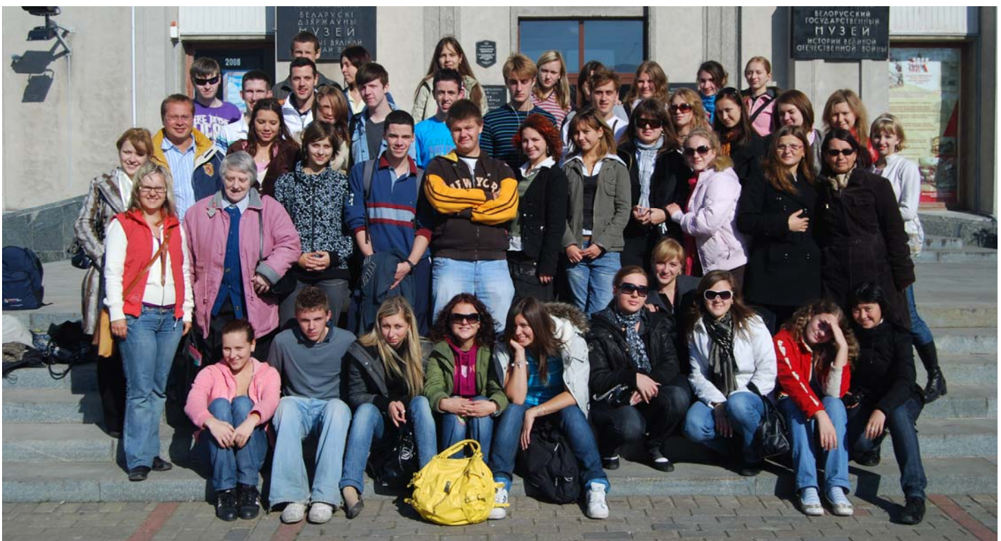
Outside the War Museum with participants from Ireland, Russia, Belorussia and the Ukraine.