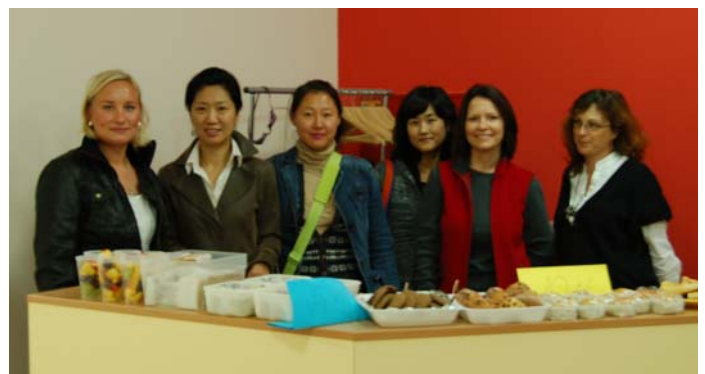
Some of our hardworking Parents